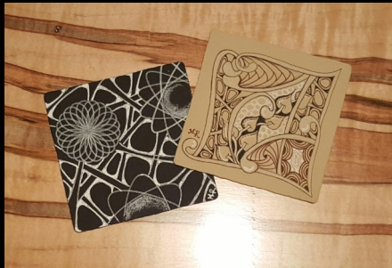
Black & Tan Tiles